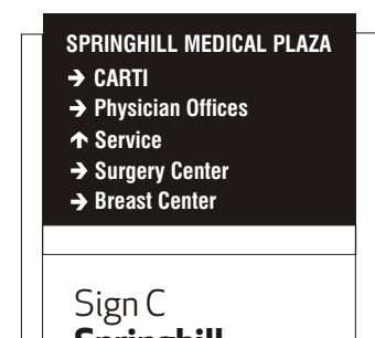
Sign C Springhill Medical Plaza Entrance Turn right