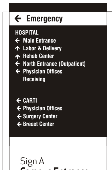
Sign A Campus Entrance Smokey Lane/ Springhill Drive intersection